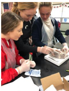
Honors Anatomy classes dissected pig hearts.