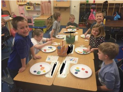
Kindergarteners learned about primary colors and mixing paint!

Middle School took quizzes and tests on the Chromebooks and utilizing QR readers to check math unit rates.