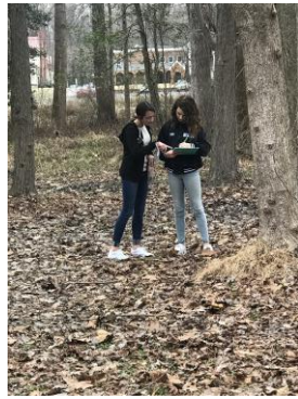
7th graders went on a botany scavenger hunt to begin their unit on plants.