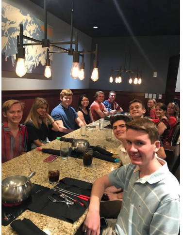
The Dual Credit French class enjoyed a French lunch at the Melting Pot!

Spanish 1 and 2 students recently took a field trip to a Latin American Festival at TCC Roper Arts Center in Norfolk where they were able to see traditional dances from nine Latin countries. Three lucky students had the opportunity to go on stage and show off some of their moves! After the show, they took a trip to a local Puerto Rican restaurant- De Rican Chef, in Virginia Beach for some traditional cuisine. Students indulged in empanadas, pernil (roasted pork), rice, beans and three types of dessert- tres leches cake, churros and flan. Everyone had a great experience!